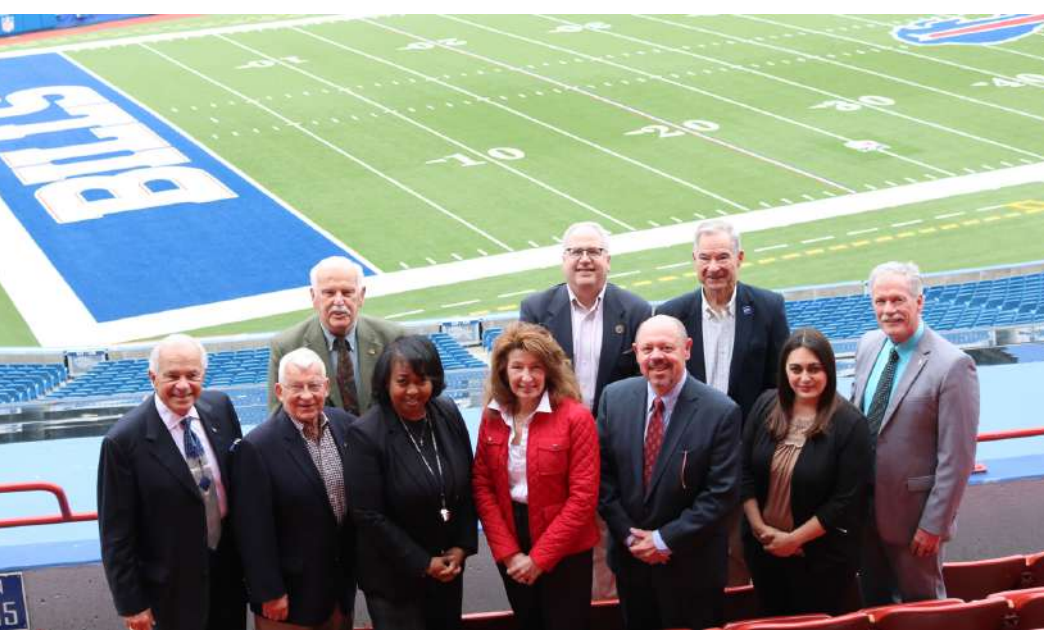
*Not all Board Members are pictured

The Erie County Law Enforcement Foundation, Inc., is a non-profit, non-political, tax-exempt 501 (c)-3 corporation that assists federal, state, and local investigative and law enforcement agencies by providing grants for special equipment and technical training that may not be funded through their budgets. The Foundation also sponsors seminars on topics of timely value to such agencies.